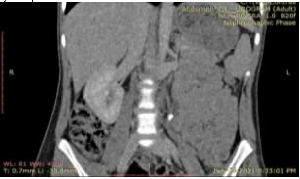
Fig 2: Right dysfunctional atrophic kidney with renal and ureteric calculi.

Fig 1: Obstructing calculus in left mid ureter resulting in upstream mild hydronephroureter