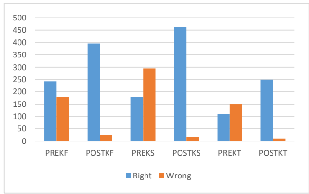
Figure 2: Shows Nurses Knowledge Pre- and Post- educational Program Domains.

PREF. = pre knowledge first domain, PRES. = pre knowledge second domain, PRET. = pre knowledge third domain