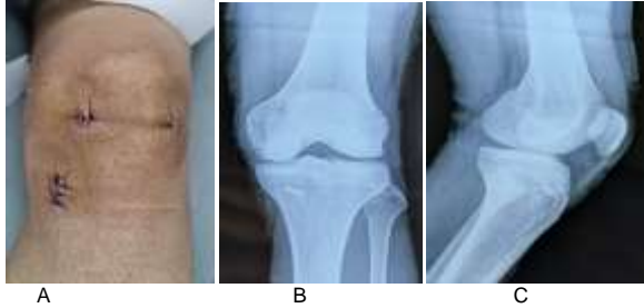
Figure 3 A: Post-op wounds. B: Post-op X-ray AP view. C: Post-op X-ray Lateral view.

In the immediate postoperative period, immobilization of the knee joint, icing and elevation was continued. Physiotherapy of the knee joint was started on day one postoperatively with isometric knee contraction and complete extension of the knee. Patient was discharged after 4 days and physiotherapy/rehabilitation continued as planned for the next 6 months with frequent follow-ups in the outpatient department.