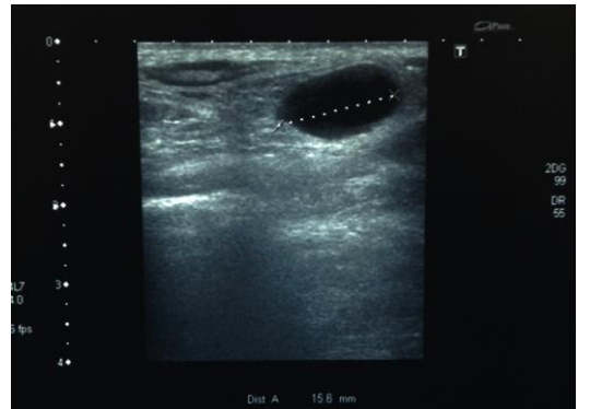
Figure 1 Hernial sac with appendix