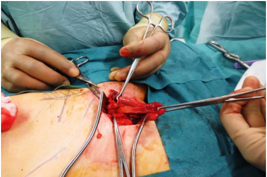
Figure 2 Inflamed appendix in a femoral hernia