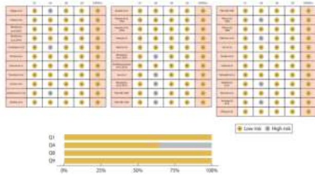
Figure 3: The Critical Appraisal Checklist for Quasi-Experimental