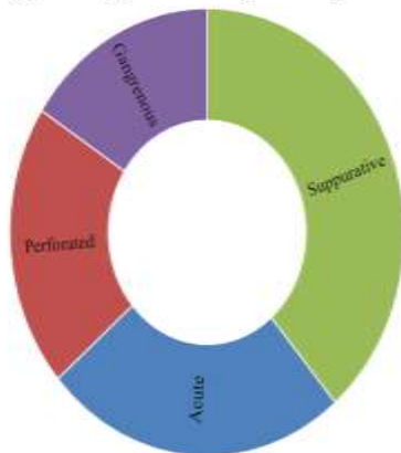
Figure 1: Percentage of cases of appendicitis according to complications.

The different characteristics of appendicitis patients were calculated as mean±SD. The results were statistically analyzed by comparing with the different characteristics of healthy individuals using unpaired t-test. The results showed that respiratory, pulse rate, temperature, sodium and potassium levels of appendicitis patients were significantly (< 0.0001, < 0.01, <0.05, <0.001) higher than the control group as presented in Table 1.