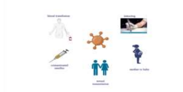
Figure 1: Transmission of HBV and HCV

Pathogenesis: The Cytotoxic T lymphocytes (CTL) mediated immune response is strongly linked to the development of HBV. Granzymes(A class of serine proteases having ability to induce the cytotoxicity of invasive, diseased, or cancerous cells<sup>6</sup>) A and B, which cause infected cells to apoptose, are two key serine protease granzymes secreted by CTL cells as part of their role in mediating viral clearance. HBV proliferation, though, has the ability to surge the synthesis of apoptosis inhibitors such as serine protease inhibitor Kazal (SPIK), making the cells resistant to CTL-mediated immune death. Hepatitis B cirrhosis and hepatocellular cancer can occur as a consequence of the immune system's failure to eliminate HBV-infected cells, which can also cause chronic hepatitis B<sup>7</sup>.