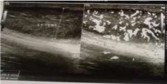
Fig-3: A heterogeneous area is noted in left testis with increase in internal vascularity

Usually complex mixed solid/cystic structure, may be isoechoic to the rest of the testis, evidence of epididymitis and evaluation of debris or encapsulation to suggest a pyocoele.