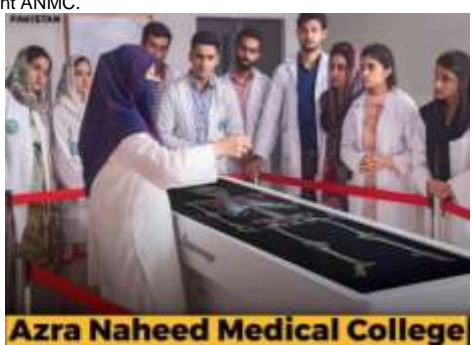
Fig. 3: Teaching session on Anatomage table showing skeleton of human

Fig. 2: Teaching session with 2^{\rm nd} year MBBS students in anatomy department ANMC.