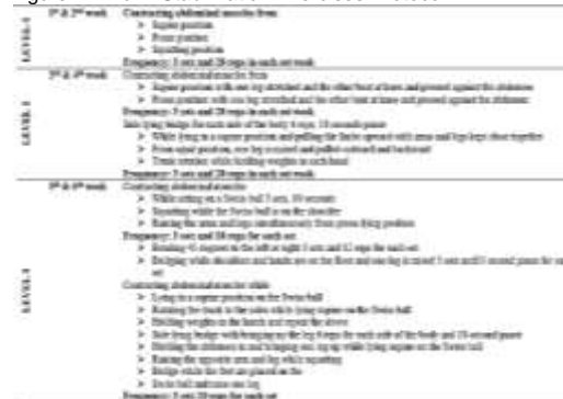
Figure 1: Trunk Stabilization Exercises Protocol

Statistical analysis: Using SPSS 23, data analysis was executed. Demographic data was computed using mean and standard deviation to interpret the descriptive statistics. For quantitative data, mean and standard deviation were preferred execution while qualitative categorical data has been presented in the form of percentage or frequency table if applicable. Shapiro-wilk test has been used to assume normal distribution of data. After assuming normality, parametric hypothesis testing was considered and independent sample t test was used to assess mean difference between groups while within subject variance, time effect and interaction effect, repeated measure ANOVA test was used. P-value<0.05 was considered significant to reject null hypothesis.