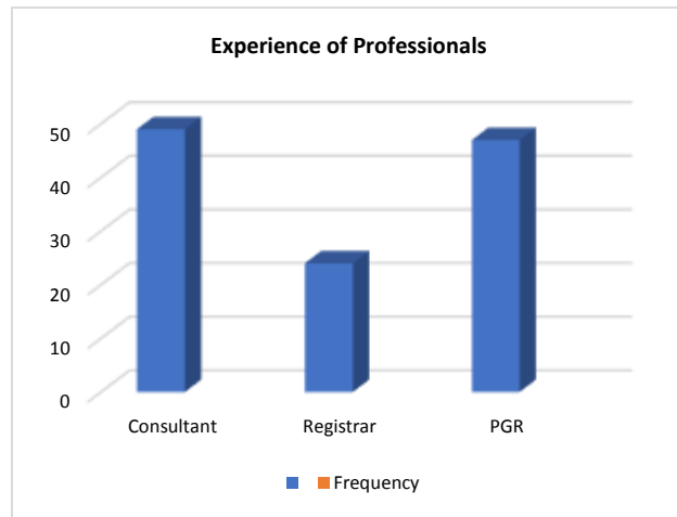
Figure 3: Describe the frequency of Surgeon Experience in term of frequencies and percentages. 49(40.8%) were Consultant, 24(20.0%) were Registrar, 47(39.2%) were PGRs.