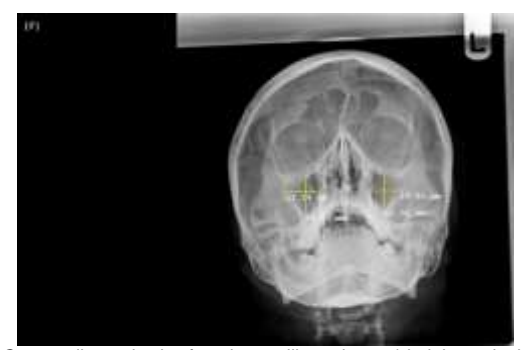
Fig.2: On a radiograph, the female maxillary sinuses' height and width are shown in millimetres.

Dimensional measurements obtained from radiographs are fed in excel spreadsheet (Windows7) and spss version 20 software is used. To analyze differences between males and females gender, T student test is used.