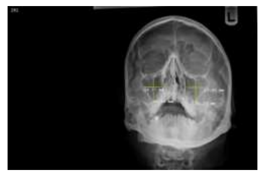
Fig.1: On a radiograph, the male maxillary sinuses' height and width are shown in millimetres.

This study included 128 individuals (64 men and 64 women) who were instructed to get an x-ray (A.P view showing maxillary sinuses) after visiting Kuwait Teaching Hospital and Khyber Teaching Hospital Peshawar for ENT-related issues. Age between 25 and 40 years, eruption of all permanent teeth, and radiographs showing fully developed left and right maxillary sinuses with clarity, appropriate density, and contrast were the inclusion criteria. Radiographs having processing errors, artefacts, as well as images with diseases or abnormalities of the maxillary sinuses were excluded. After official permission from the administration of Kuwait teaching hospital & Khyber teaching hospital Peshawar, the patients who are visiting the said hospitals for their treatment, and who have done their digital radiography (A.P view showing maxillary sinus) for their E.N.T related problems, verbal informed consent from such patients were taken. All radiographic samples have their height and width measured using an image processing software called microdicom. This developer was given a reference radiograph of the left and right maxillary sinuses, and under the direction of a radiologist, height and width were measured in the half along the coordinate axes of radiographs.