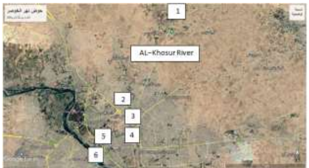
Figure 1: Aerial map of the city of Mosul and the sampling sites on the Khosur River

Six sites were identified along the river basin (the waterfalls region, Al-Sukkar bridge, Al-Qadisiyah bridge, The Old bridge of Al-Muthanna, Al-Sueis bridge and the last location was at stone bridge, which is near from Mosul old bridge). Water samples were collected with 3 replicates for each site. As for the sediment samples, they were collected by removing the surface layer of sediments for 10 cm depth and collecting a composite sample from the sediment <sup>(9)</sup>.