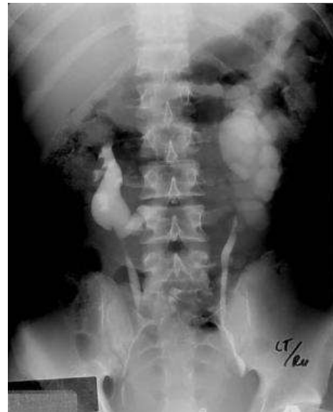
Fig 2: Excretory urogram shows a horseshoe kidney with left hydronephrosis

The internal drainage via DJS as recommended for six (6) weeks, but two weeks drainage is not inferior. 17 : In paediatric patients external drainage via a feeding tube is preferred as this can be removed as a day case without anesthesia. 18