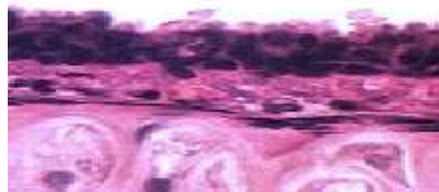
Fig 2: Trachea of cigarette smoke-exposed rat, showing an epithelial cellular hyperplasia and inflammatory cell infiltration