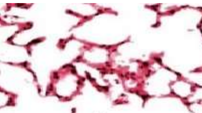
Fig 4: Control lung alveoli