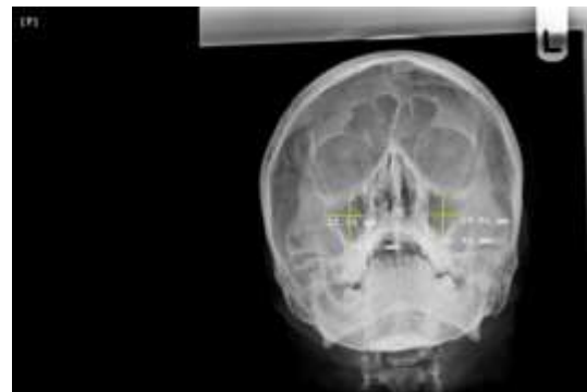
X-Ray Scan showing measurement of maxillary sinuses (height and breadth) in millimeters in females

Measurements of dimensions obtained from radiographs were fed in excel spreadsheet and SPSS Version 20 software is used. To analyze differences between males and females gender, T student test is used.