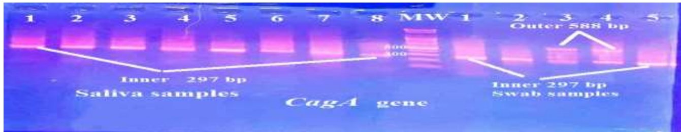
Figure 2: Gel electrophoresis of PCR products (inner 297bp) and (outer 588bp) for cag A gene. At left, Lanes 1-8: nested PCR product of clinical saliva sample. Lane MW: 100bp ladder. At right, Lanes 1-5: PCR products of clinical oral swab samples. (2% agarose, 7 v/cm 2 , 45 min).

Regarding sensitivity, specificity, positive predictive value and negative predictive value of Vag A for biopsy samples in comparison with saliva and swab, as illustrated in table (7)