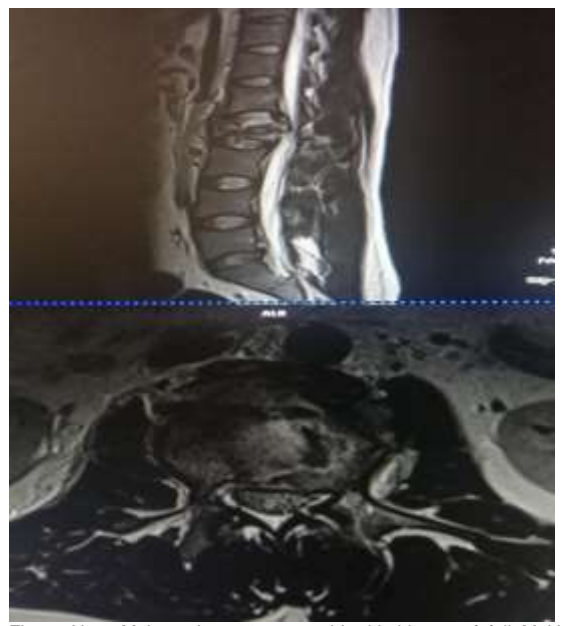
Figure No.3 Male patient 30 years-old with history of fall Multiecho and multiplanar MRI T2 sagittal + Axial images through lumbosacral spine shows anterior wedge compression fracture with destruction of L2 vertebral body causing retropulsion osseous component indenting the thecal sac and compressing the bilateral exiting nerve root at L2/L3 level.