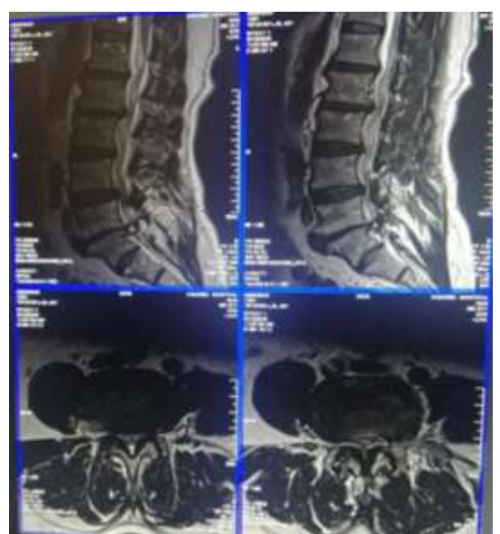
Figure No. 2. 45 years-old male with complain of lower backache. Multi echo multiplanar both Sagittal and axial images through the lumbar spine shows (Right)left lateral disc bulge with left lateral annular tear with bilateral facet and ligamentum hypertrophy with left lateral annular tear abutting bilateral exiting nerve root at L4/L5 level. (Left)Complete disc desiccation with reduced disc space and anterior disc protrusion noted at L5/S1.Axial images reveal diffused disc bulge with central annular tear with bilateral facet and ligamentum flavum.