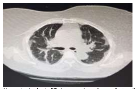
Non-contrast chest CT images of another patient with COVID-19 pneumonia. CT images show bilateral peripheral areas of ground glass opacities.