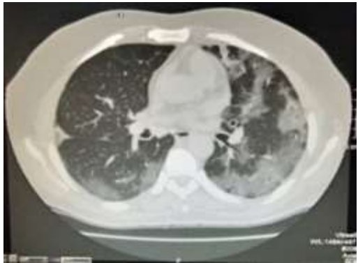
Non-contrast chest CT image of a patient with COVID-19 pneumonia. CT image shows typical bilateral peripheral ground glass opacities.

solitary zones are considered by each lung segment. However, this was not the case with upper left lobe of apicoposterior segment. Here there were two separate zones were created as apical and posterior. Additionally, the lower left lobe which were considered as two separate zones; as medical and posteromedial basal segment. A The Linkert Score system of degree of 0, 1 and 2 was provided. This indicates the intensity of involvement. It states that zero score indicates no involvement, whereas the Linkert figure 1 shows the involvement which is less than <50%. However, the remaining figure Linkert indicator figure 2 indicates the intensity of involvement if more than >50% by one zone. The total range of score for this test lies between 0-40. This score helps us to categories the patients based on their mild and severe cases. Here the score of less than <20 indicated mild infection, whereas, the score which appears more than >20 indicates the severity of the case.