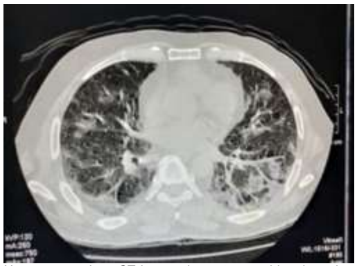
Non-contrast chest CT images in a 50-year-old male patient having severe COVID-19 pneumonia. Chest CT images show bilateral areas of ground glass opacities and consolidation with vascular dilatation.