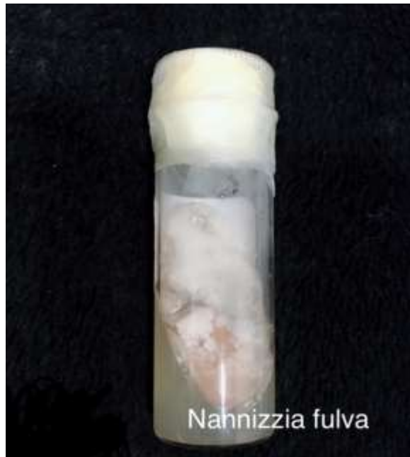
Fig 2: Nannizzia fulva culture showing pinkish-buff in colour