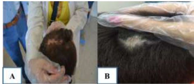
Fig 1: (A) Symptoms of ringworm of scalp on 8-years old girl. (B) on 10-years old boy

Sequencing and phylogenetic analysis: The ITS region on rDNA was amplified by using universal primers ITS1 and ITS4 which yielded in PCR product size ranged approximately between 444 and 555bp in N. fulva . Phylogenetic analyses of the ITS region of this study were compared with the dataset of different countries isolates originated from different sources .