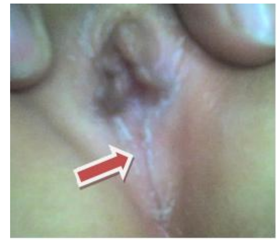
Fig 1: This figure shows complete occlusion of the vaginal orifice, below the clitoris, due to fused labia. Note the

Table 2: This table shows a diverse pattern of paediatric gynaecological disorders seen in CH &ICH during January 2008 to June 2009. Note the menstrual disorders being the commonest presenting ailment (35.3%). Where CH&ICH: childen hospital and institute of child health, PV: per vaginal, UTI: urinary tract infection, PCOs: polycystic ovaries. *generalized weakness, veginismus, mineral deficiency including rickets, juvenile diabetes, obesity not relating to gynaecological origin, and cases referred from nephrology, medical, surgical and orthopaedic in and outpatient departments for gynaecological consultations.