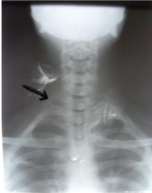
Arrow pointing towards a cervical rib