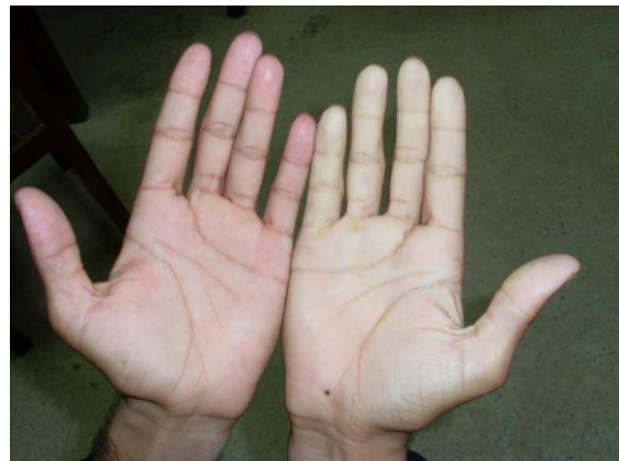
Blanching of right hand after positive elevated arm stress test

After anti-coagulant therapy, patient was prepared for the cervical rib resection. The supraclavicular approach was used to access the cervical rib. After retracting Sternocleidomastoid muscle medially, and dividing the belly of omohyoid. Phrenic nerve was identified running over the Scalenus Anterior muscle and was saved. Brachial Plexus was identified and lateralized to avoid nerve root injury. Scalene anterior muscle was compressing the subclavian artery resulting in post-stenotic dilatation. Pleura was identified and anterior scalene muscle divided to approach the cervical rib. Cervical rib was resected. Hemostasis secured and neck closed after putting in a suction drain. The drain was removed after 24 hours. Post-operative recovery was uneventful.