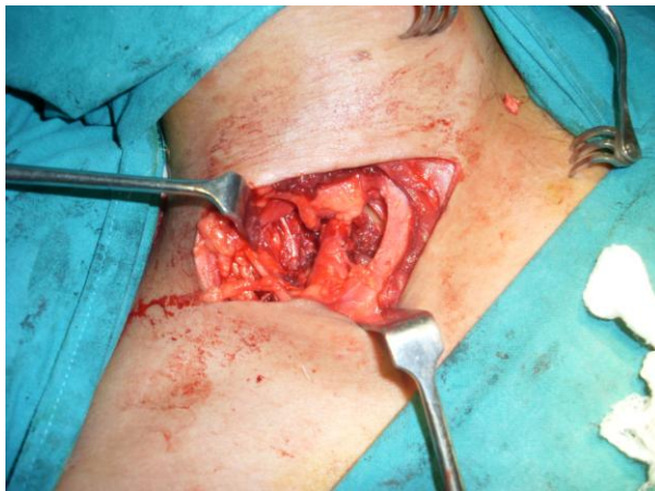
View after rib resection