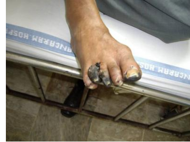
Figure 1: The First patient of the Study, Wagner's Stage 4

Outcome was assessed predominantly on the improving of the size of ulcers. The duration of ulcers before therapy were ranging from 6 to 15 months. The number of sessions of intravenous soft laser therapy was ranging from 15 to 25, depending upon the severity of the lesion and the response of the treatment. The duration of the treatment was ranging from 30 to 50 days, again depending upon the severity of the lesion and the response of the treatment. Up to the stage 3, all patients responded well and were cured. However in two patients, recurrence of ulcer occurred, which responded well to the retreatment. In stage 4, feet of all patients were saved, but one patient has ray amputation of one toe before the start of soft laser therapy. However the rest of the foot was saved with the use of intravenous soft laser therapy. In stage 5, patient ultimately needed amputation of the foot. No complication of the procedures observed during study.